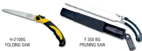
H-210BG FOLDING SAW