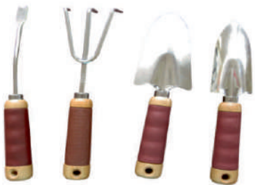
50507/51507/52507/53507 CULTIVATING TOLLS