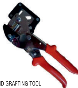
13131Z HAND GRAFTING TOOL