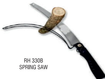
RH 330B SPRING SAW